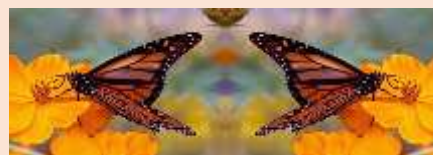
Papillion Monarch Butterfly

EXILE , IA. Ruthie, NA gold lager, cans 0.5% 6